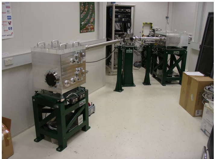
Infrared High Resolution beamline branch.

Installation of the Infrared (IR) Beamline by the contractor, FMB, is almost complete and delivery of the IR microscope and spectrometer is due in early March.