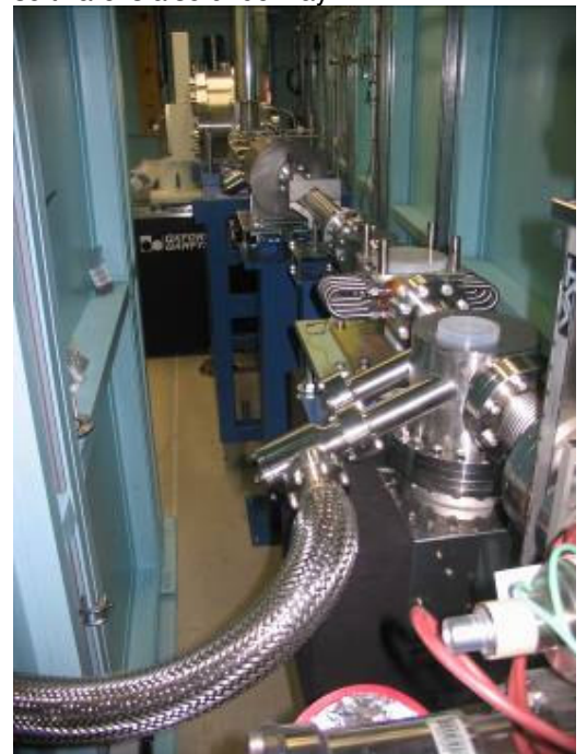
Looking downstream from right at the storage ring shield wall): the first ion pump, fixed mask, Bremsstrahlung collimator, white beam slits, white beam fluorescent screen and the double crystal monochromator installed and pumping down.

table designed to position and support the 7m SAXS camera and the WAXS camera will begin at about the same time. Many of the parts for the SAXS camera and its positioning system on the optical table are being fabricated. Beamline controls development is going well, and the critical task of developing the beamline controls software is also underway.